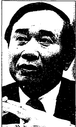
John Huang was forced on Ron Brown as Commerce deputy (l); Bill Clinton leads Brown's mourners.

So, Hillary, I'm back, flowers and vote in hand.